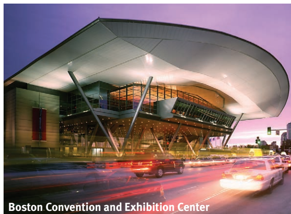
Boston Convention and Exhibition Center

Branches wishing to sell items in the designated branch sales area during the convention must contact Rhine’s office to secure guidelines and forms. The