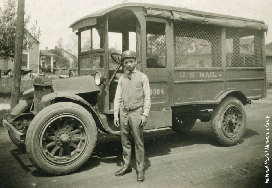
National Postal Museum Library