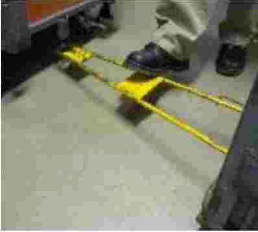
Exhibit 7 Swivel Tow Bar

The swivel tow bar is for general use to connect a PIV to wheeled equipment, or to connect wheeled equipment to wheeled equipment for towing. The swivel tow bar has longer prongs than folding tow bar.