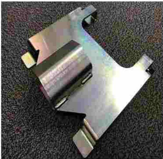
Exhibit 8 Snap-On Tow Pocket – Rigid Wire Container