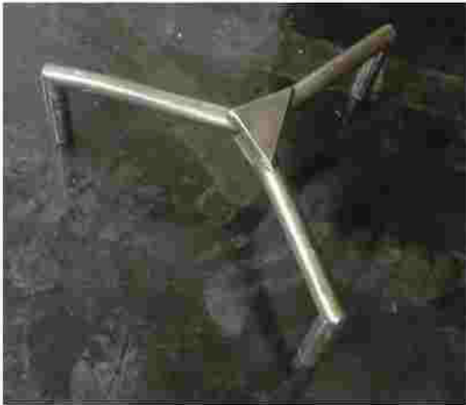
Exhibit 6 Integrated Tow Bar

The three-pronged coupler is for general use to connect a PIT to a wheeled equipment or to connect wheeled equipment to wheeled equipment for towing. The three-pronged coupler does not fit the BMC-OTR container because of the fixed distance between the prongs.